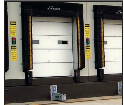
▲ Serco Vertical Dock Levelers do not compromise the energy efficiency of the insulated doors because they're installed inside the facility.